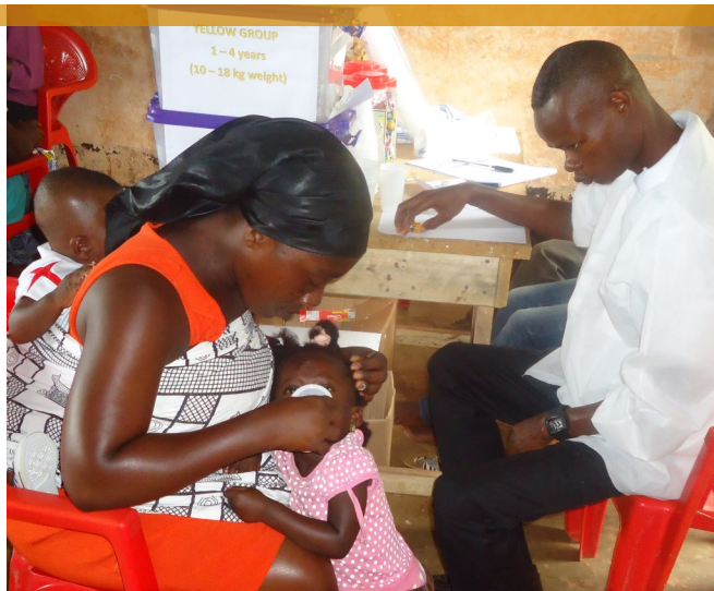
A mother gives her child the first dose of SMC observed by a trained member of the study team

Children who reported illness or fever at the time of SMC administration were screened with a rapid diagnostic test and, if positive, treated with either a short-acting or long-acting antimalarial therapy according to their research group.