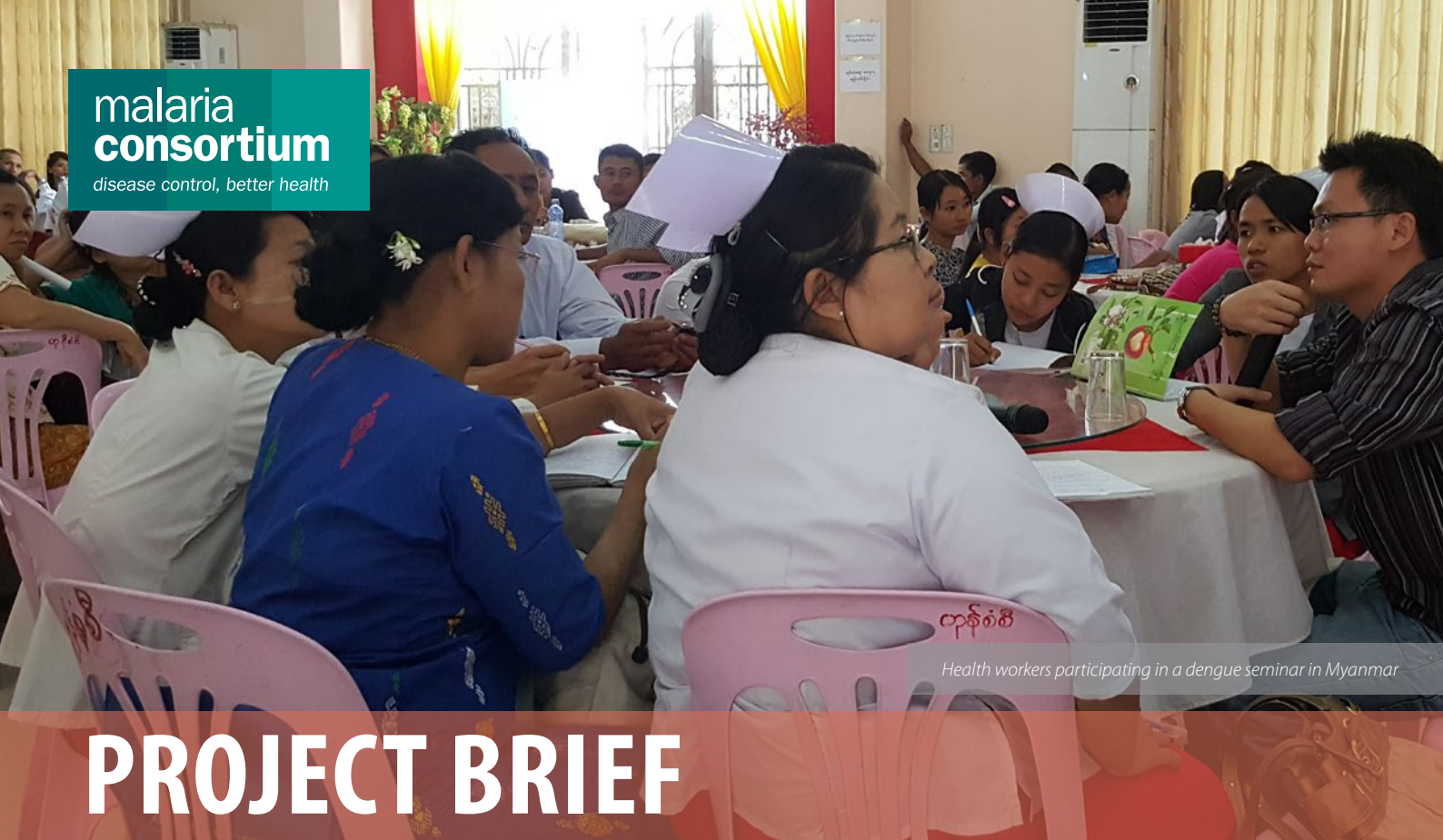
Health workers participating in a dengue seminar in Myanmar