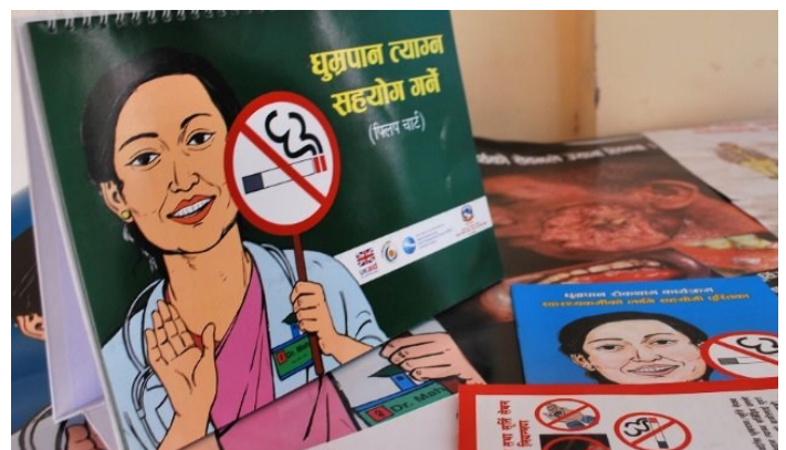
Flipbook, posters and leaflets are used to make counselling sessions more structured and effective

With the growing trend of tobacco use in Nepal, behaviour change interventions that can be delivered in PHCCs could be an effective way of helping tobacco users to quit.