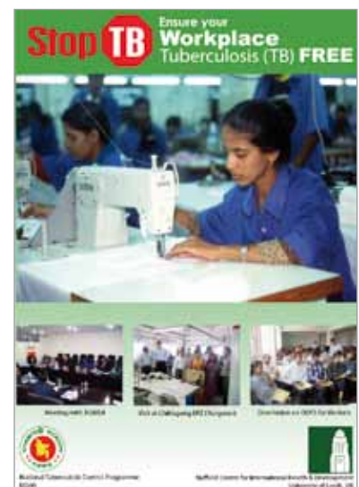
Example of COMDIS research into policy and practice change in Bangladesh